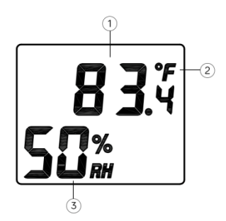
Figure 2: Sensor display layout