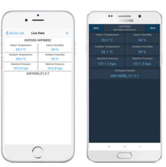
Figure 6: WS View Plus/ Ecowitt APP Live Data Screen (IOS & Android)

After correct Wi-Fi configuration on the gateway, you can view all sensor data on the "Live Data" screen of the WS View Plus/ Ecowitt APP application.