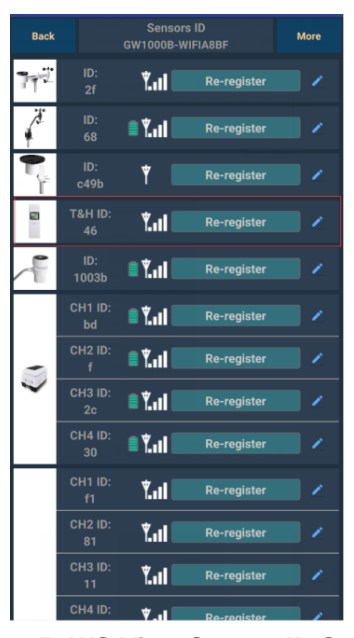
Figure 5: WS View Sensor ID Screen